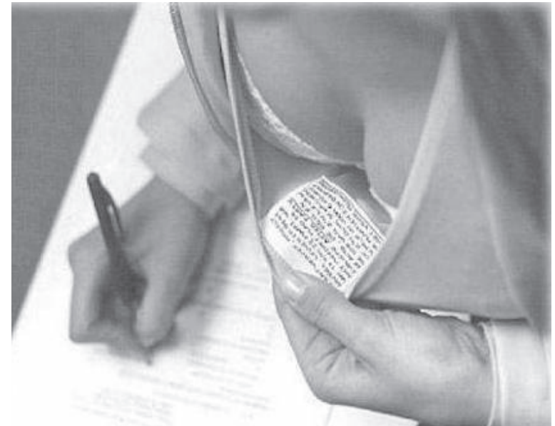
It's hoped that these policies will prevent cheating, like pictured here